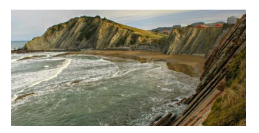
An afternoon spent visting the amazing rock formations - called The Flysch - and then the lovely coastal town of Zumaia.