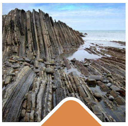
ZUMAIA & The Flysch